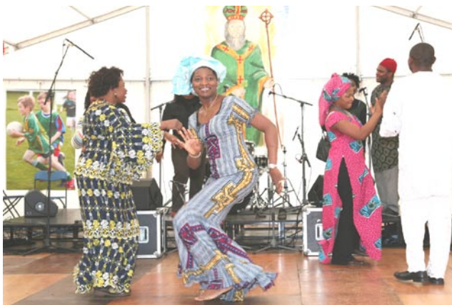
Nigerian Choir and Dancers at last years St Patrick's festival Glasgow