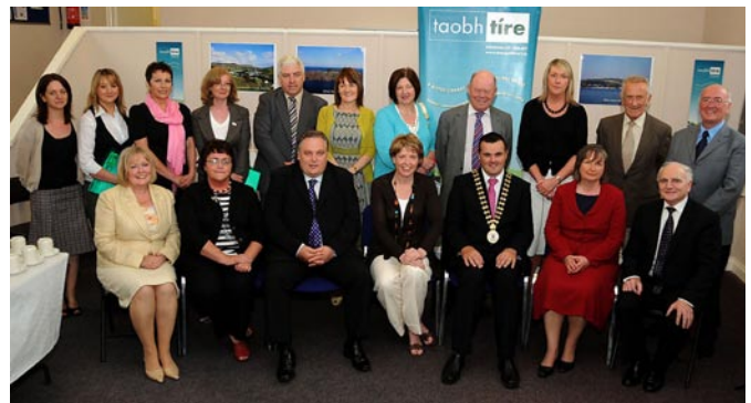
The Launch of the Final Report on the Taobh Tíre library Research Project at the Forge Family Resource Centre, Pettigo

Tánaiste and Minister for Enterprise, Trade and Employment, Mary Coughlan T.D. launched the final report on the Taobh Tíre library research project at the Forge Family Resource Centre, Pettigo recently.