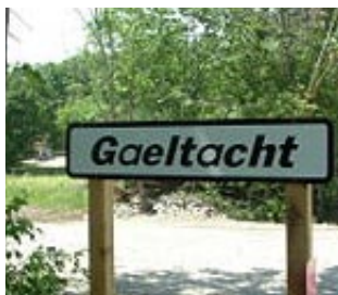
A Gaeltacht sign leading to the town of Tamworth in Ontario.