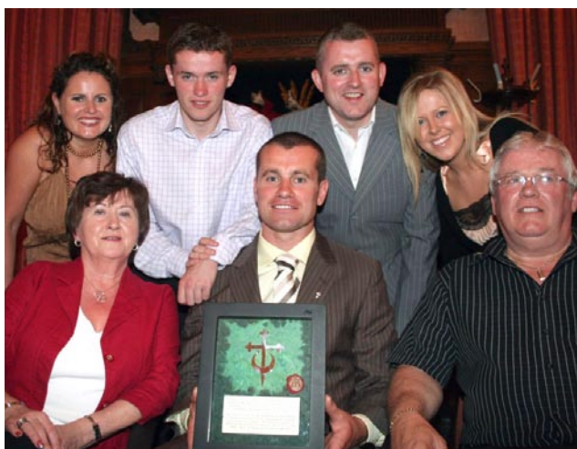
Shay Given pictured in June 2006 when he was accorded the county's highest honour at a Civic Reception hosted by Donegal County Council at the County House, Lifford. Shay is pictured with members of his family.