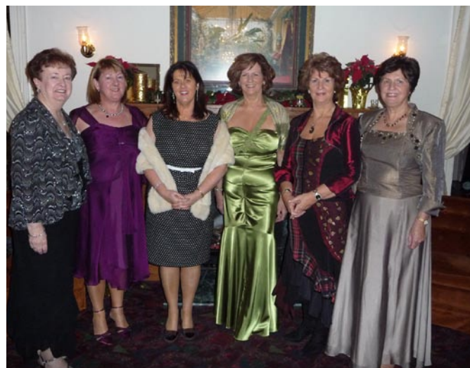
Philadelphia Donegal Association Dinner Dance