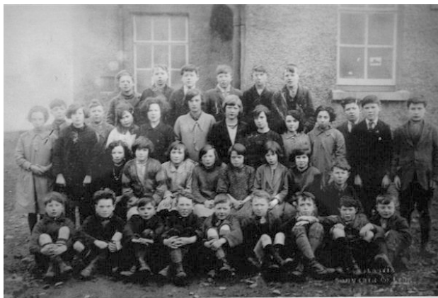
Group of pupils at Meenderry School around 1933-35

The former pupils of the old Meenderry School, Falcarragh, situated in the heart of the Cloughaneely Parish will celebrate a Reunion next August, when ex-pupils will meet again to reminisce and rejoice of the days of yore. Indeed hardship and sadness will also be very much part of the mindset as hundreds of ex-pupils endured both in abundance, at home in the Lagan and as emigrants in foreign lands.