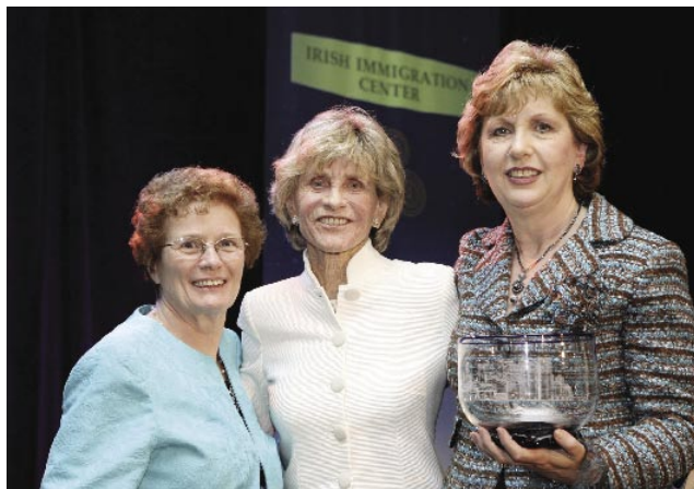
960 Guests and President Mary McAleese Toast Irish Immigration Center on Memorable Evening