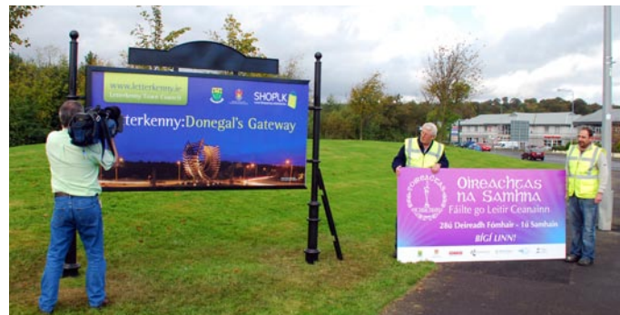
Preparations underway for Féile Oireachtas na Samhna Leitir Ceanainn

I rith na seachtaine beidh cruinnithe cheannbhliana eagrais ghaelacha, taispeántais, ceardlanna, comórtais éagsúla ceoil, ceoil uirlise, damhsa, dreas cainte, scoraíocht, scéalaíocht agus sceitsí 'Luibíní', drámaíocht, agus spóirt lománaíocht agus Gailf agus Paráid Óige ar siúl. Críochnófar le hAifreann an Oireachtais ar an 1ú Samhain a bhéas a chraoladh beo ar Raidió na Gaeltachta