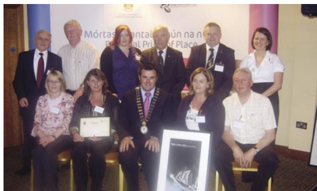
Forbairt na Rosann Teo accepting Donegal 2009 Pride of Place award

Pride of Place is an all-island competition which is directed towards recognising improvements by local communities to create civic pride in their area. The competition focus is on people coming together to shape, change and enjoy all that is good about their area.