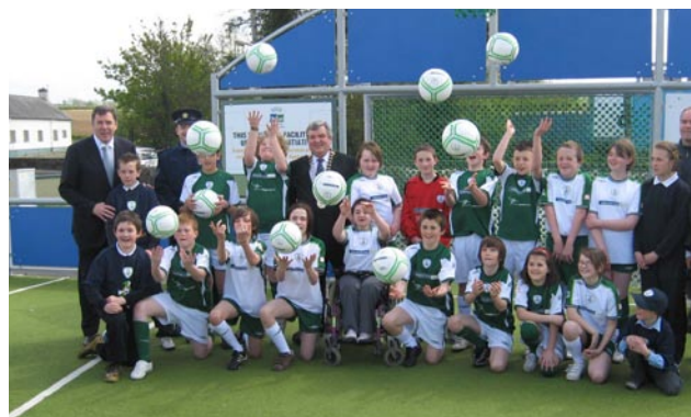
Launch of Ballyshannon Minipitch, April 2009

Further information is available from www.donegalcddb.ie