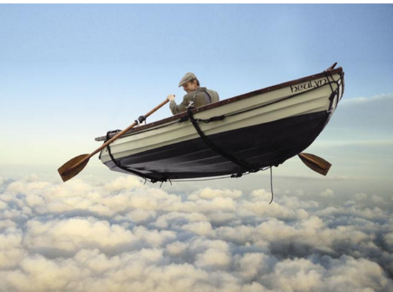
'Wired and Free', Fidget Feet Aerial Dance Company. COMMISSIONED BY DONEGAL COUNTY COUNCIL FOR DONEGAL BAY AND BLUESTACKS FESTIVAL.

Further information is available from www.donegalcddb.ie