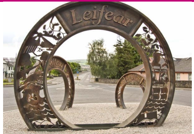
Sculpture "Three Coins", Lifford, County Donegal

For further information please contact Donegal County Museum at email museum@donegalcoco.ie