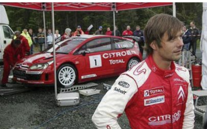
Reigning World Rally Champion Sébastien Loeb

For further information on the World Rally Championship, please visit http://www.rallyireland.org