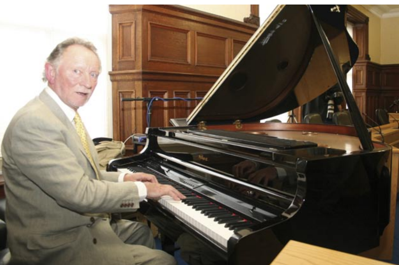
Phil Coulter pictured at the County House, Lifford, County Donegal

Donegal County Council conferred the internationally renowned musician, Phil Coulter, with the Freedom of Donegal at a civic reception in his honour on 22nd May 2008 in the County House, Lifford, County Donegal.