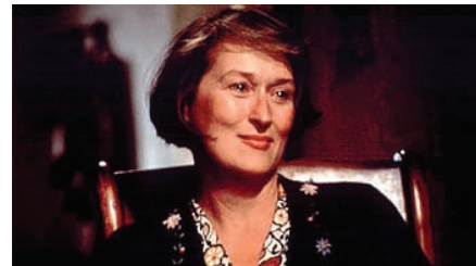
Meryl Streep in Dancing in Lughnasa

Meryl Streep is seeking to research her Irish great-grandmother and to spend more time in Ireland.