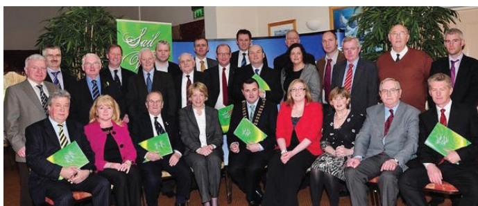
Participants attending the recent SAILWEST Project Launch