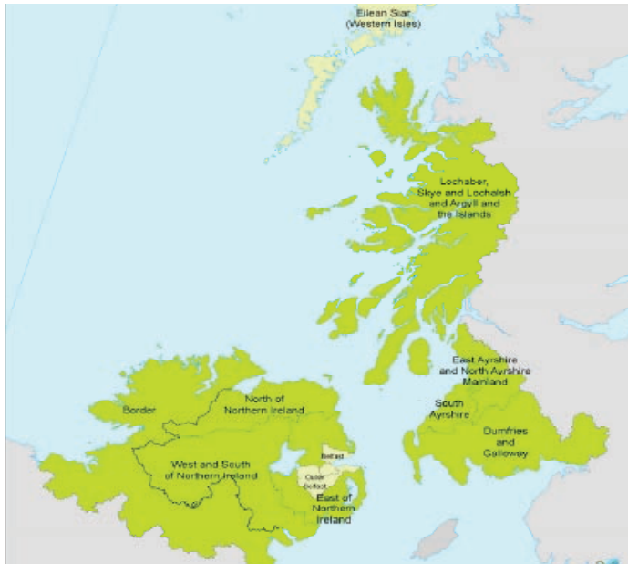
Sailwest Partner Areas

€7M Tourism initiative was launched in Donegal Town, Co. Donegal on Friday 26th March, by An Tánaiste, Mary Coughlan, TD