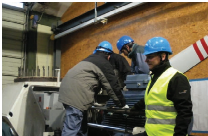
Figure 2 BZEE Nacelle workshop, Husum, Germany.