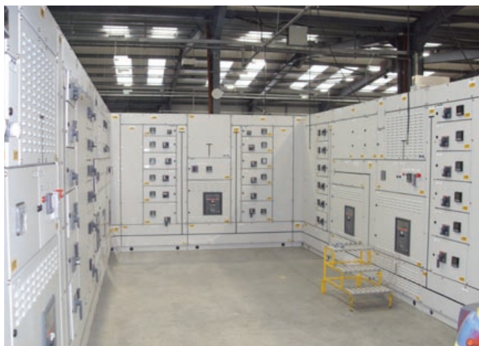
Electronic System produced by E&I Engineering in the Burnfoot plant