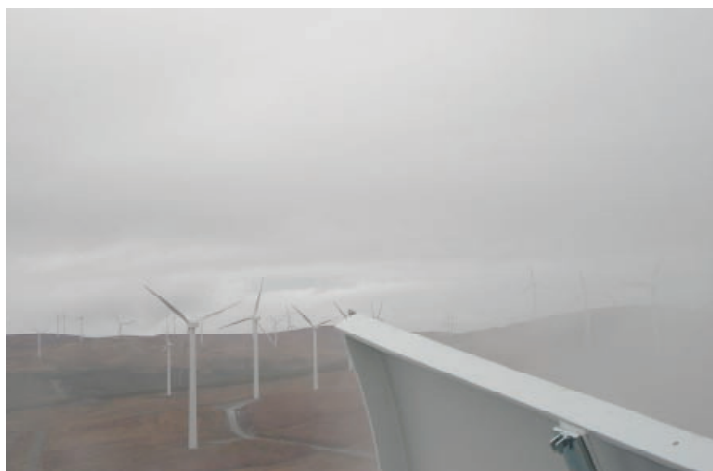
Figure 1 Foggy Sky's, Meentycat Wind Farm; View from a Siemens 2.3MW Turbine.