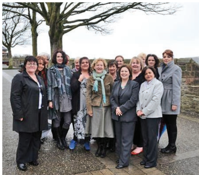
Women into Public Life Steering Committee