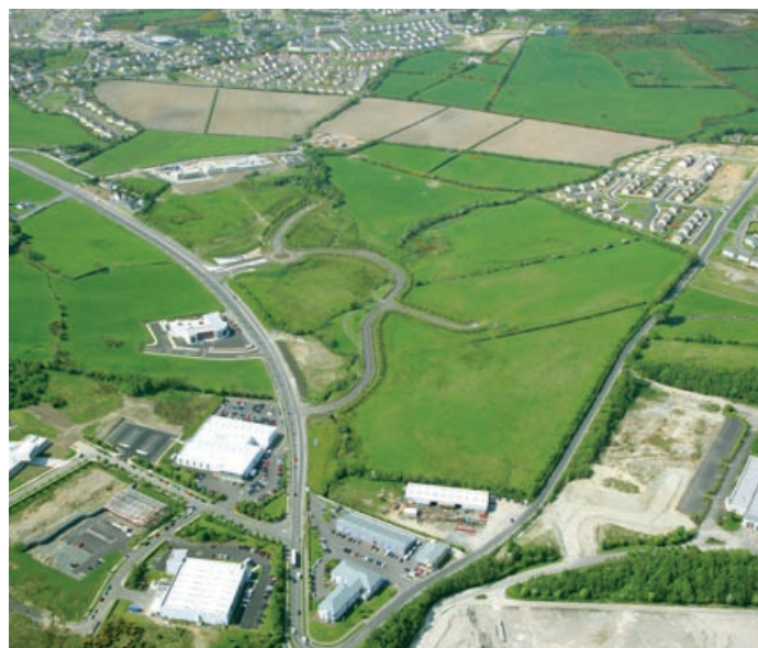
An aerial view of the IDA's Letterkenny Business and Technology Park