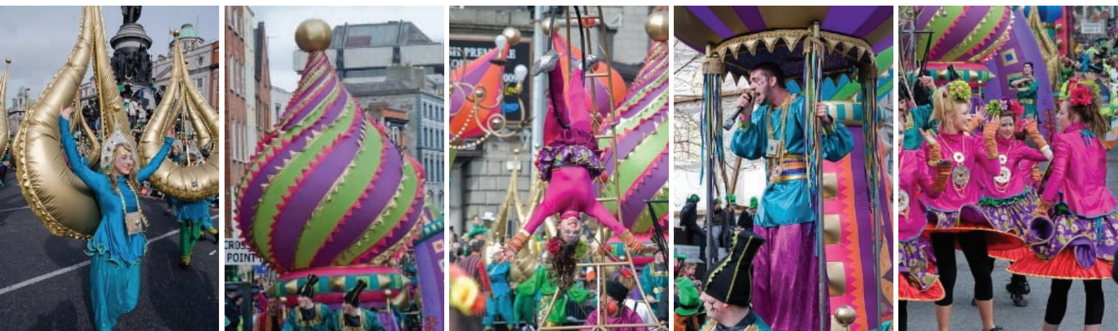
ISADORA by LUXe at the St. Patrick's Day Festival Parade in Dublin 2010