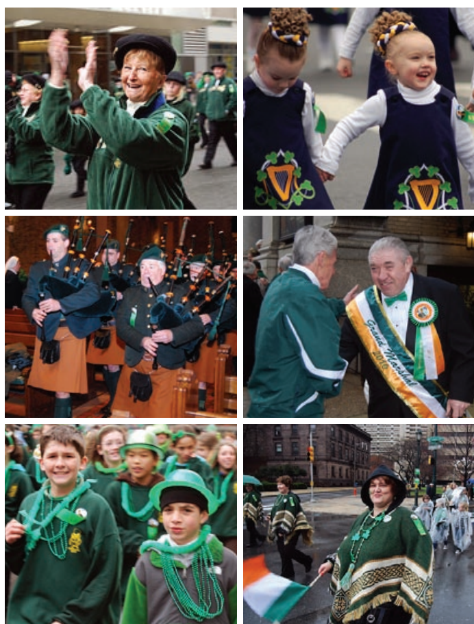
For more photos visit: www.irishphiladelphia.com